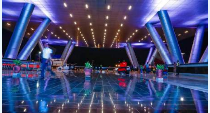
A night view of the Modified Terminal building at Entebbe International Airport.

state-of-the-art fire trucks were commissioned by the Minister of Works and Transport, Gen. Katumba Wamala, at Entebbe International Airport in October 2024. In November 2024, the first Entebbe International Airport Safety Week was successfully conducted under the theme 'Safe Airports, Stronger Together.' The event provided a platform for all stakeholders to collectively reflect on the achievements in ensuring safety at the airport, reaffirm their commitment, and highlight safety's critical role in advancing the development of the aviation industry.