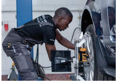
Axle Foley Autohouse Itd offers top-notch car servicing by skilled technicians using advanced equipment. We prioritize customer satisfaction, provide comprehensive services with genuine parts, and ensure transparent communication throughout the process, guaranteeing reliable and professional maintenance for your vehicle.