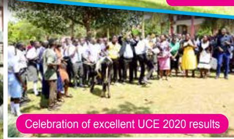
Celebration of excellent UCE 2020 results

P.O Box 33014 Kampala - Uganda, Tel: 0782 441 077 / 0702 993 989 / 0776 183 773 / 0703 259 585