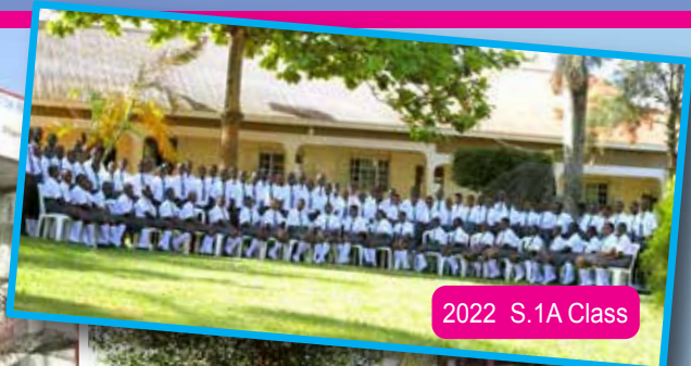
2022 S.1A Class