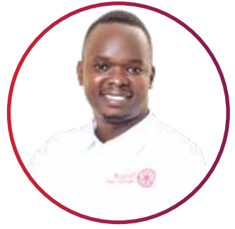
Rtr. Denis Ssebagala Photographer